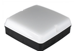
Black | Lumaax™