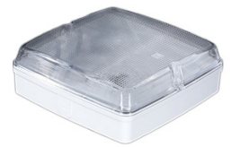
White | Clear