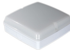
White | Lumaax™